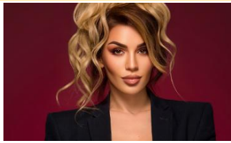
Albania BESA - TITAN